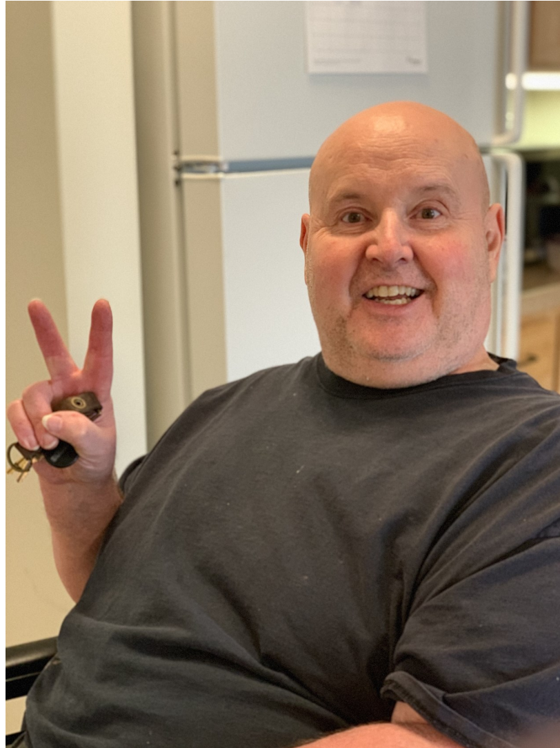
Image Description: Newly transitioned consumer poses with a peace sign for a picture in his home.

CILCP's Independent Living Program provides a wide range of services at the core of the CILCP. Using the vast resources available to persons with disabilities, CILCP's experienced staff assisted consumers navigate their service plans and personal goals, which includes Nursing Home Transition. In 2020 our staff coordinated transitions from the nursing home to the community for 11 people!